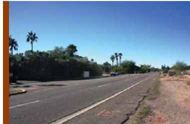
Existing Lincoln Drive

A design charrette is a process for collaborative problem solving and decision-making during a multi-day design event that develops the community's ideas into graphic concepts and design alternatives. Community participation is requested at the Monday and Wednesday evening sessions. You may also drop by during the day on Tuesday and Wednesday.